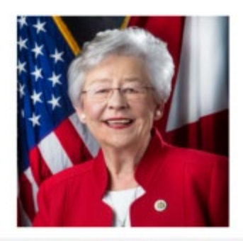
Governor Kay Ivey 54th Governor of Alabama